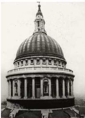
St Paul's Cathedral

Bishopsgate Library's London Collection covers inner London, with a focus on the City of London and Spitalfields, and describes all major aspects of the character of London and its social, economic and architectural development. It is particularly strong on 19th-century social history, but has many wider materials about the capital's long and varied history. The collection continues to grow with the addition of publications and other materials concerning the modern development of London.