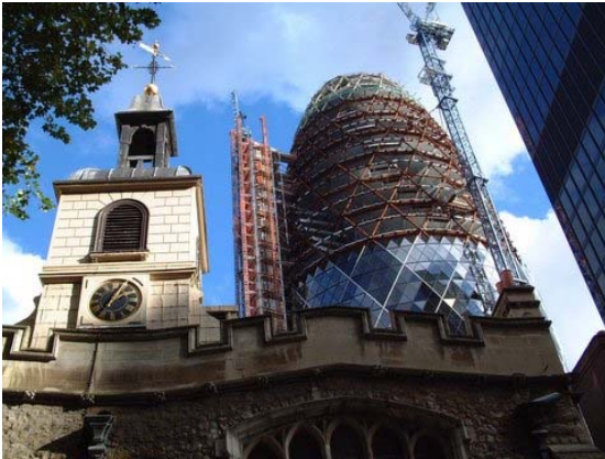
'St Helen's Bishopsgate and the Erotic Gherkin'

Our photographs document the architectural and social history of much of London from the middle of the 19th century to the present day. These include prints by S.H.R. Salmon of churches, Paul Barkshire's images of buildings, and the London History Workshop collection which illustrates extensively the capital's social and cultural life. We also have 120 photographs from the Society for Photographing Relics of Old London, taken between 1875 and 1886. The prints and watercolours are of churches and buildings in Bishopsgate and the City, many of which are by J.L. Stewart and a number by T.H. Shepherd.