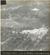
London and Middlesex Archaeological Society (LAMAS), Bishopsgate Institute

The archive theme for this week's concert is nature. Bishopsgate Institute may be situated in the City but we can help you discover the natural world through our library and archive collections.